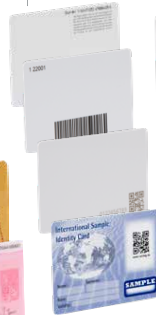
Number Printing / Lasering