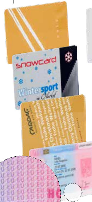
Special Prints & Effects